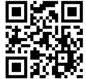
IMC Digital Technology Awards 2018