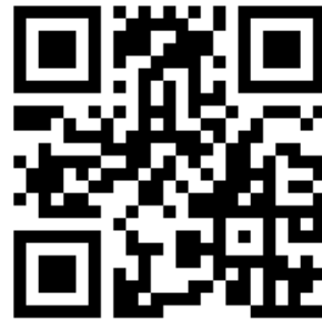
IMC Digital Technology Awards 2016