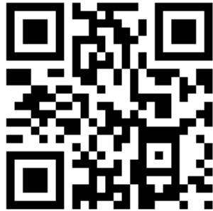
IMC Digital Technology Awards 2015