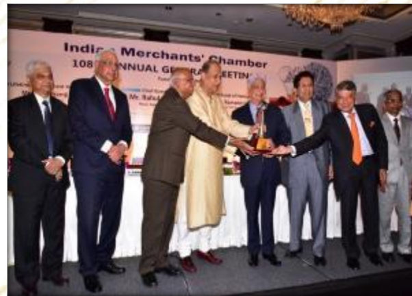
SHRI. AZIM PREMJI Chairman Wipro Limited