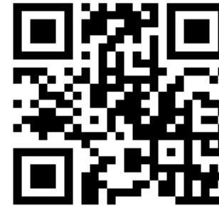
IMC Digital Technology Awards 2017