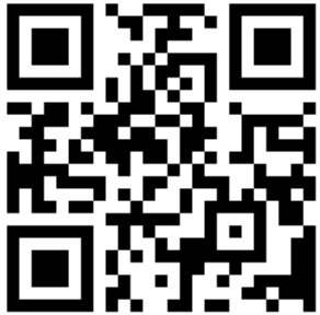
IMC Digital Technology Awards 2013

Re-visit our events live by scanning the QR Code given below