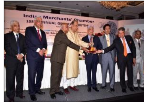
SHRI. AZIM PREMJI Chairman Wipro Limited